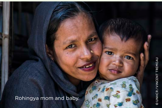
Rohingya mom and baby.

Thank you for what you do right now... for refugees—hurting people who need a hand! ♥